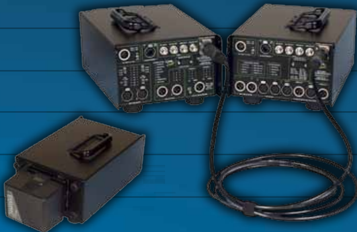
Anton/Bauer battery mount standard on Camera End Unit and portable version of Control Room Unit. Battery not included.

At Studio Technologies we design and manufacture dependable, high-performance audio products for demanding professionals. For over 30 years we have never wavered in our commitment to building rock-solid products and offering outstanding customer service. Our products are used worldwide in broadcast, studio, stadium, and corporate environments.